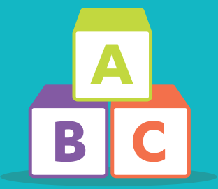
Childcare and Education (Education T level)

3 pathways from within 3 T level routes delivered by a small number of providers