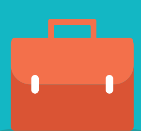
Business and Administration (full route)