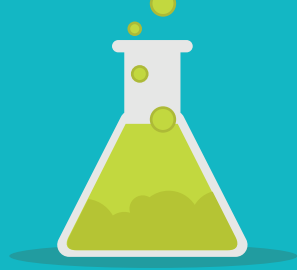
Health and Science (full route)