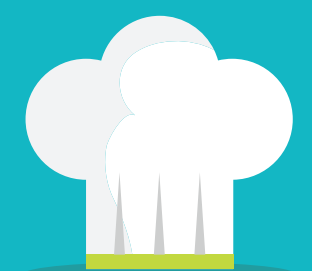
Catering and Hospitality (full route)