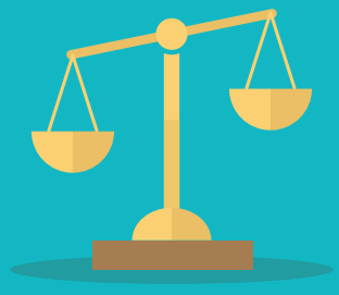
Legal, Finance, Accounting (full route)

all pathways from the first 6 T level “priority routes” delivered by selected providers