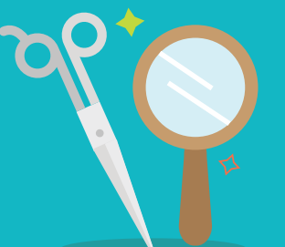
Hair and Beauty (full route)

all pathways from all T level routes available to be delivered by providers that want and are able to