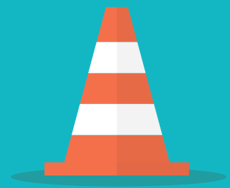
Construction (Design, Surveying and Planning T level)