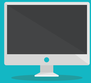
Digital (full route)