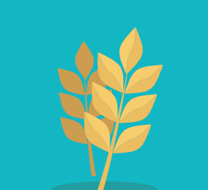
Agriculture, Environment and Animal Care (full route)