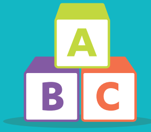
Childcare and Education (full route)